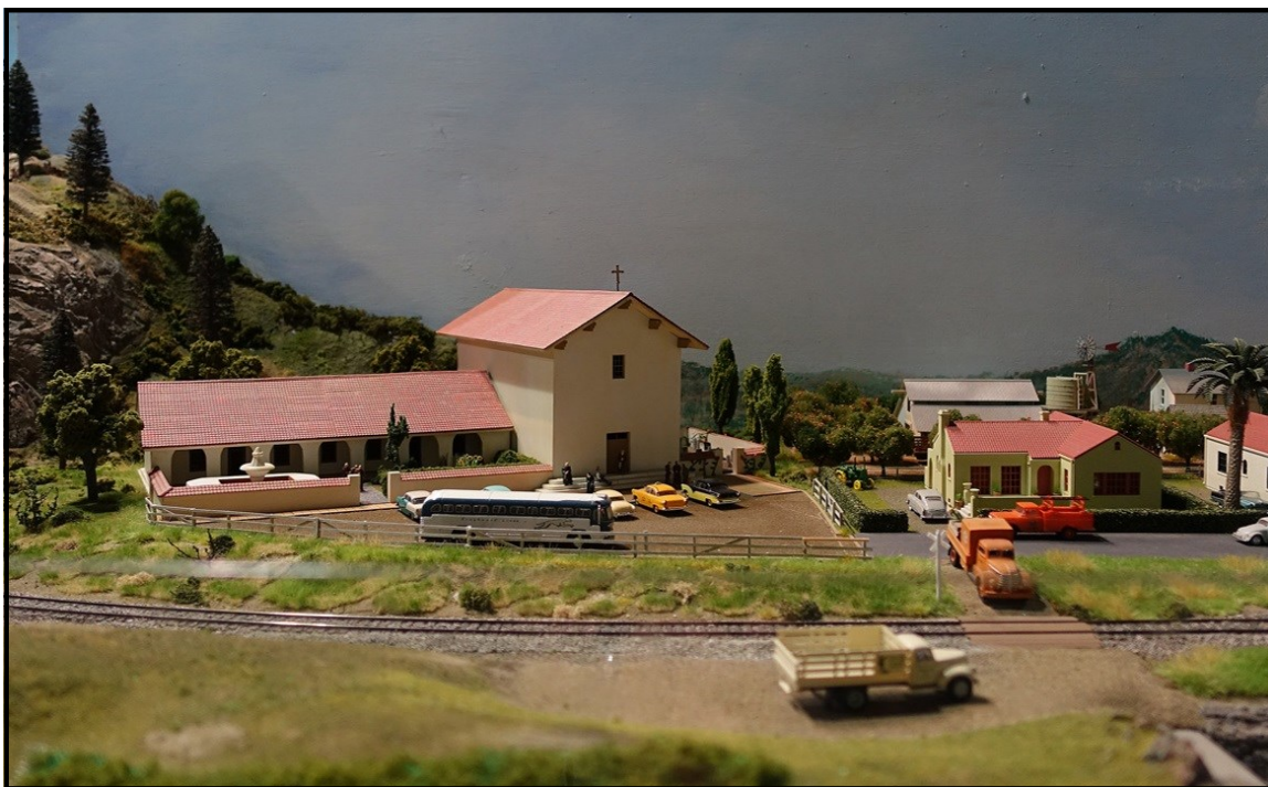
(The Photo Gallery features more San Miguel pictures, starting on Page 6)

The South Bay Historical Railroad Society (SBHRS) was incorporated in 1985 to preserve local area railroad heritage while running a working museum to serve the community. One of the benefits of the Santa Clara Depot museum is having the space available for two operational HO and N scale model railroad layout displays.