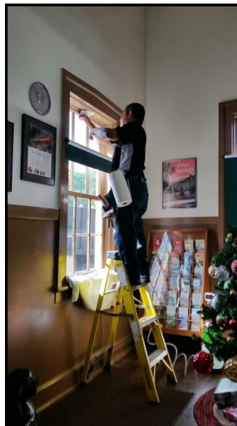
A worker from Window Solutions in Foster City applies protective film to windows in the Passenger Waiting Room

Protective window film produced by Minnesota Mining and Manufacturing (3M) has been installed on the upper tier of windows in the Passenger Waiting Room and over the windows in the Library of the Santa Clara Depot.