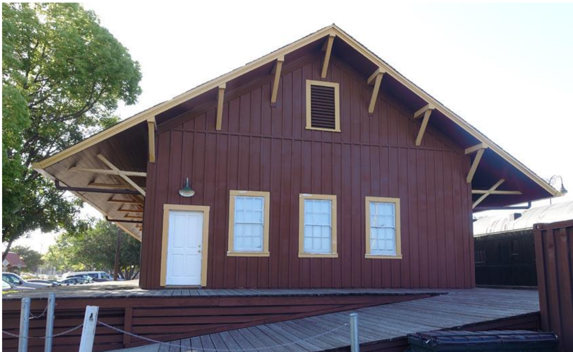
Looking Good On Sunday!