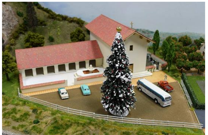
Work continues on the San Miguel section, during HO Workshops, held on Thursday evenings from 5 to 8 PM.

The first SBHRS Open House for 2017 was held on April 9th and 10th. There were 623 paid admissions, as well as the many younger visitors, who are admitted free. The Company Store operated this year in a different venue: HO scale items were still displayed for sale in the main Museum Room, while N scale items were relocated to the Board Room. Income from the Company Store, including both locations was $6,186. The All Day Lunch counter received $603 gross income, before deductions.