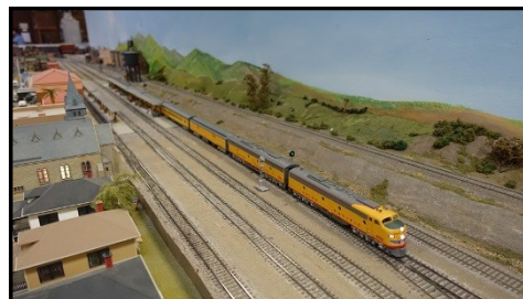
Left Winner #3, BNSF Turn, Right Winner #4 UP Portland Rose