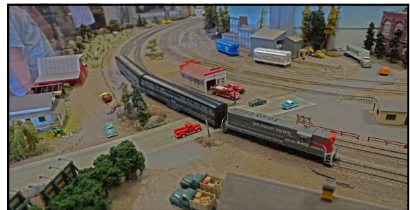
Left Winner #1, UP Granite Rock, Right Winner #2 SP Peninsula Commute #143