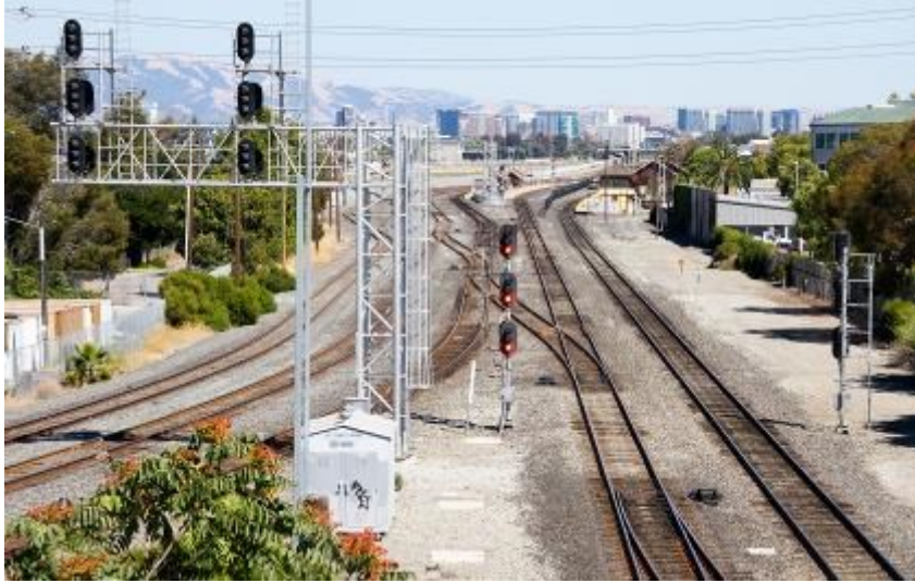
Photo 4 - Current CP Coast and CP De La Cruz Trackage

The second current photo, from a slightly different vantage point, shows better the CP Franklin trackage beyond the depot building. CP Franklin was first created at the time the tower was deactivated, consisting of a RH crossover and a turnout to the Santa Clara Drill. This was very similar to the south (RR east in SP days) portion of the tower plant in its final days. To support the station re-configuration project a LH crossover was added, making CP Franklin also a universal crossover.