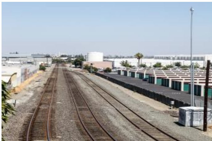
Photo 6 - Current UP CP CO045 CP Coast Bungalow and Antenna

As hinted at above, the current collection of four CPs was preceded by two, an earlier CP Coast and an earlier CP Franklin. Those were created when the tower was retired from service. The electronics for that initial CP Coast were housed in a large beige bungalow that sat on the west side of the ROW a short way north of the tower. It wasn't particularly photogenic and I didn't have ready access to an image of it - no loss there.