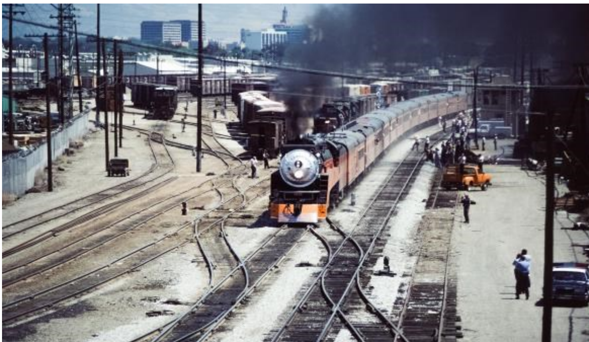
Photo 8 - May 1984 Steam Excursion at Tower