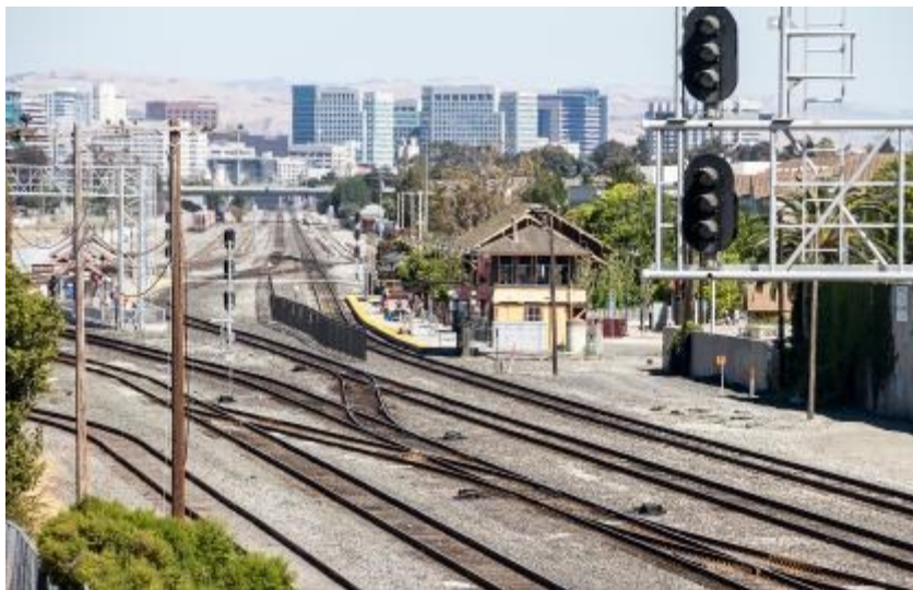
Photo 5 - Current CP Franklin Trackage

The second current photo, from a slightly different vantage point, shows better the CP Franklin trackage beyond the depot building. CP Franklin was first created at the time the tower was deactivated, consisting of a RH crossover and a turnout to the Santa Clara Drill. This was very similar to the south (RR east in SP days) portion of the tower plant in its final days. To support the station re-configuration project a LH crossover was added, making CP Franklin also a universal crossover.