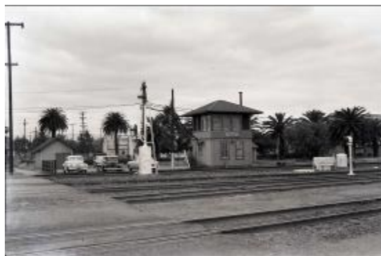
Photo 3 - Tower in 1954 from Brokaw Rd. Crossing