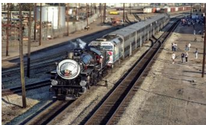
Photo 7 - September 1991 Steam Excursion at Tower, Jim Bartolotta photo

Toward the end of the tower's operational life another change was the restoration to operation of SP 2472, which had sat rusting at the San Mateo Fairgrounds for decades. A Peninsula excursion with the 2472 leading an early livery Caltrain F40 was captured in 1991 near the tower. The crowd of railfans to the right of the tracks are standing where the initial CP Coast bungalow would land a few years hence. In contrast to the current photos, note the Newhall Yard trackage still in place with a good number of freight cars present. The passenger boarding facilities (behind the special train) were relatively primitive, non-ADA-compliant, and required observation of the Holdout Rule due to passengers walking across active main track to reach some trains.